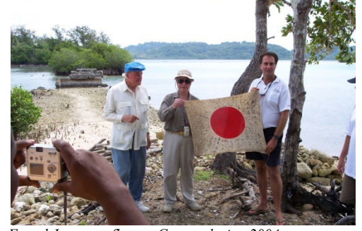
Found Japanese flag on Gavutu during 2004 tour